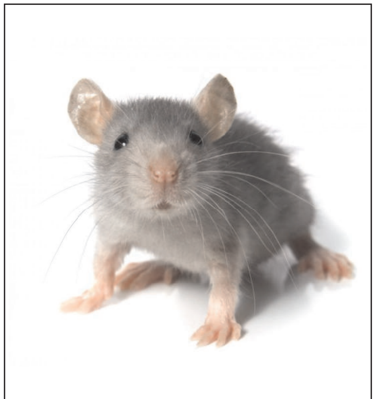
Now that Murch is headed for renovation, its mouse population faces an uncertain future.

But he predicted that the two-year construction of a new Murch "will ensure a rodent-free environment."